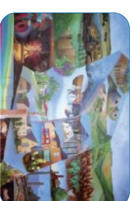
Tow Law Parish Map