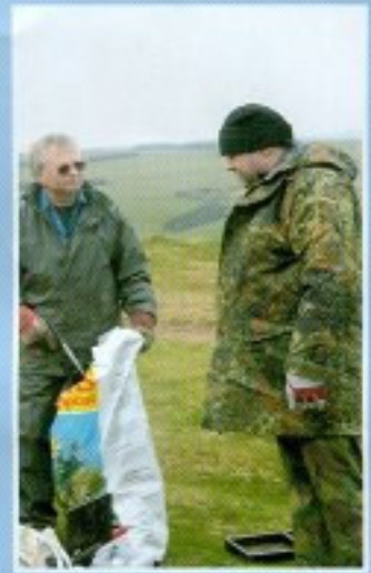
Volunteers removing fly tipping on Hedleyhope Fell