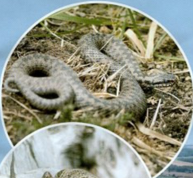
Adder and Common lizard.