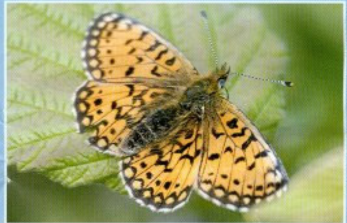
Small pearl bordered fritillary.