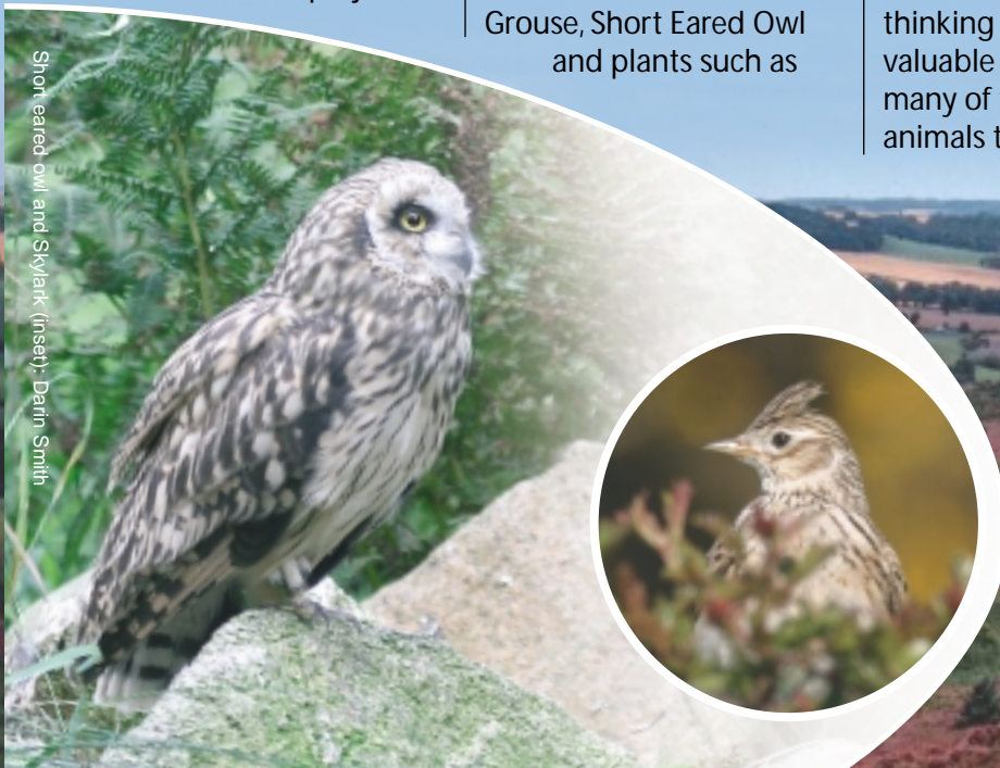
Short eared owl and Skylark (inset)