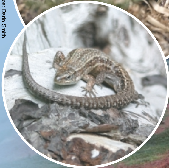
Adder and Common lizard