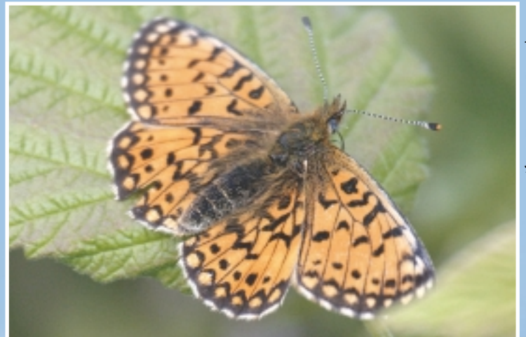
Small pearl bordered fritillary