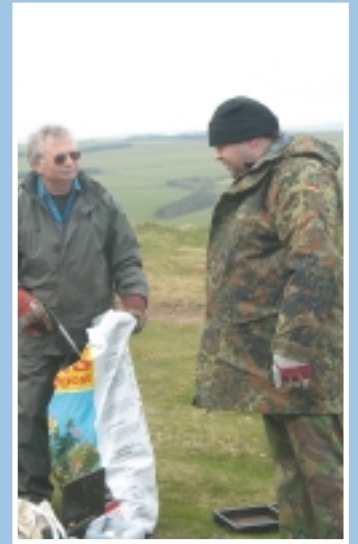
Volunteers removing fly tipping on Hedleyhope Fell